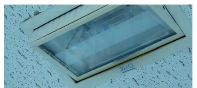
Halogen lighting - signs of overheating & flickering were present

The owners of S&K Supermarket were introduced to the services of SolX Energy by our trading partners at Get Solutions. They soon realised they could dramatically reduce their overheads and increase the well-being of staff and customers to their shop, on Barkers Butts Lane, in Coventry.