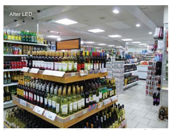
Improved light quality, resulting in brighter product displays and reduced shadows.