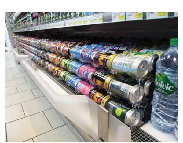
Retro-fit refrigeration scoops reduce consumption by ^10%

This in addition, to changing the light fittings, installing new motors and stop-start energy management devices are expected to increase savings on S&K (Coventry) Ltd fridges by a further 25%.