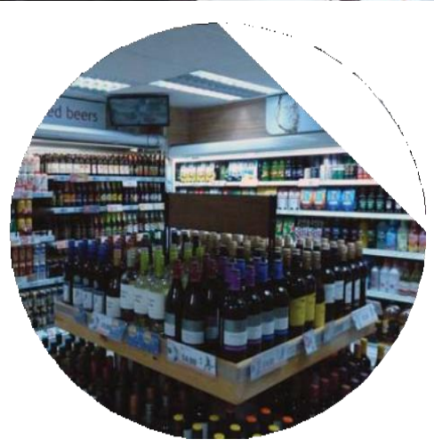
Low volumes of natural light and lumen levels

Once SolX Energy had been provided with annual billing information, we carried out a full site survey to assess the number, positioning and types of lighting units currently installed along with lighting meter readings to assess the lumen levels.