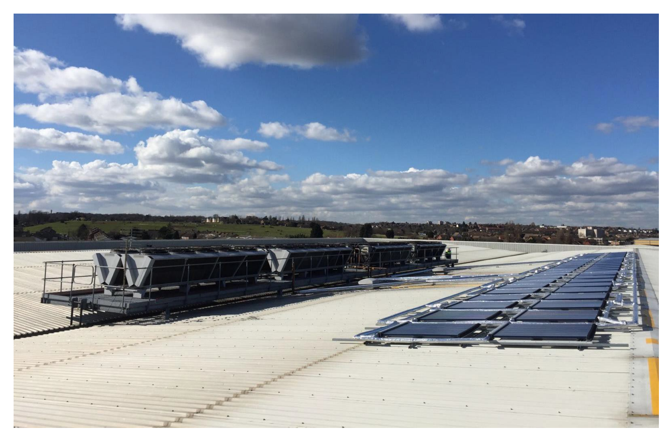
Image 3: the solar thermal collectors and the refrigeration system on the roof of the Chingford fruit facility.

The rooftop on the Chingford Fruit facility has had 54-solar thermal collectors installed in parallel across 750kW of the 1MW cooling capacity refrigeration system. The installation itself was completed by ZetaCool Services Ltd, an accredited SolX Energy Ltd installation partner, who managed the installation process in partnership with Chingford's existing refrigeration contractors STS Refrigeration - part of the ICA Group.