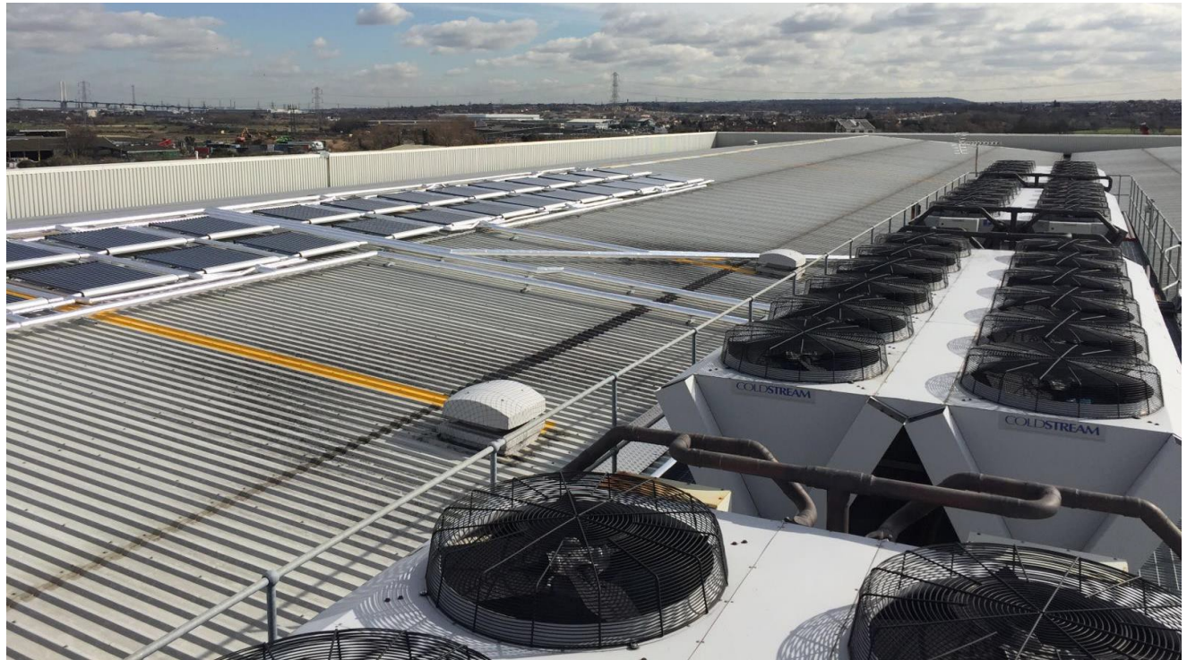
Image 1: The 1 MW cooling system on the roof of the Chingford fruit facility.

Compression technologies partnered with solar assisted heat absorption. A 1MW, 60,000 Sq. ft. refrigerated fruit packaging facility based in Kent, UK.